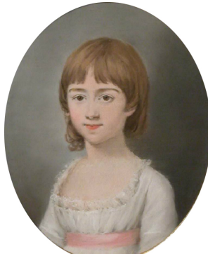
J.722.16 Gentleman, m/u, Royal Academy 1794, no. 347